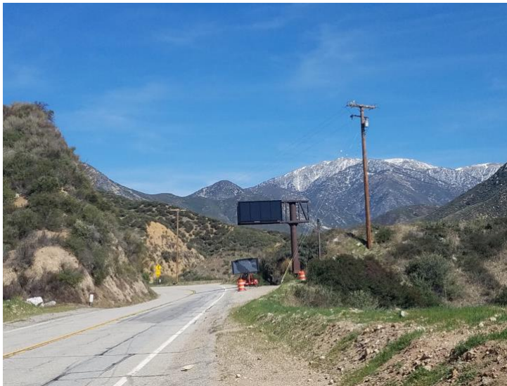
Example Overhead Sign

When USFS lots are full and roadway traffic triggers are met: