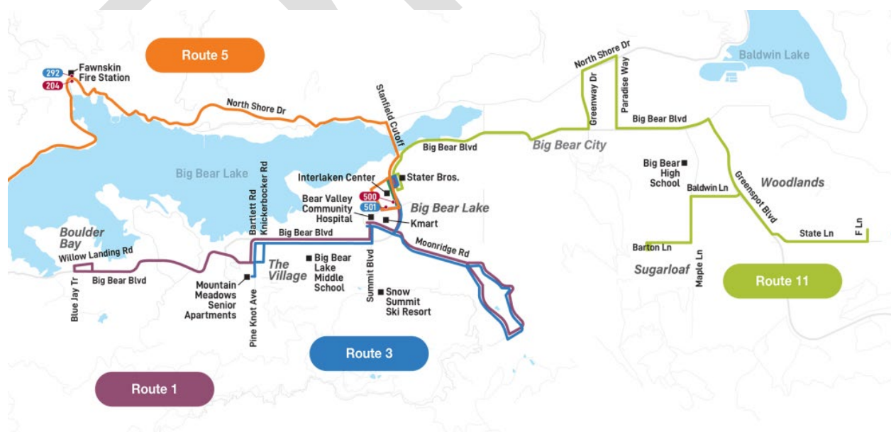
Figure 2. Mountain Transit Big Bear Routes

Limited Transit Options: Mountain Transit provides six local routes that operate throughout the week with free fare in Big Bear Valley and Rim of the World communities and two routes between the San Bernardino Mountain communities and the city of San Bernardino, making connections with Omnitrans, Metrolink, Greyhound (Figure 2 and Figure 3). The off-the-mountain services are limited to Monday, Wednesday, and Friday. Mountain Transit also operates on-demand service and a Seasonal Weekend Trolley service providing transportation between local restaurants, hotels, ski resorts, and shopping venues throughout the City of Big Bear Lake and RIM Communities in the summer and winter. There are limited transit options for travel between Big Bear Valley and the Rim communities and for connections to other subareas.