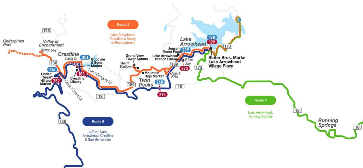
Figure 3. Mountain Transit Rim Routes